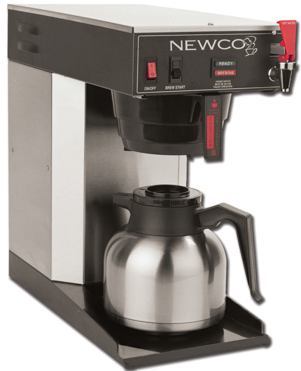
Vaculator 1.9 server, part# 111445 included

All the features are built into a stainless steel cabinet for long stability and durability.